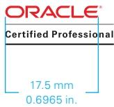
Minimum Print Size