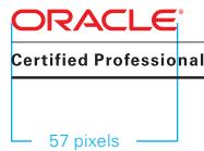
Minimum Pixel Size