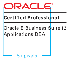
Minimum Pixel Size