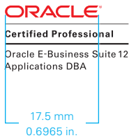
Minimum Print Size